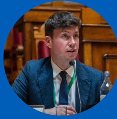
Dan Carden MP Keynote Speaker