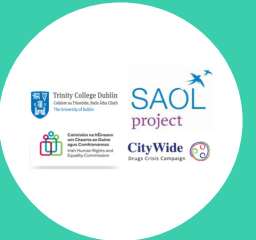
Dublin Citywide Campaign