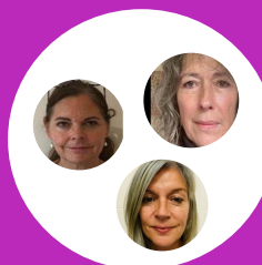
English Substance Use Commissioning Group