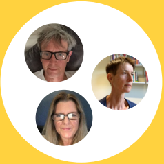
Addiction Service User Research Group